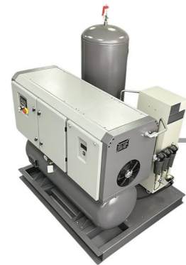
MODEL 1-NITROGEN GENERATOR 型号 1-制氮机