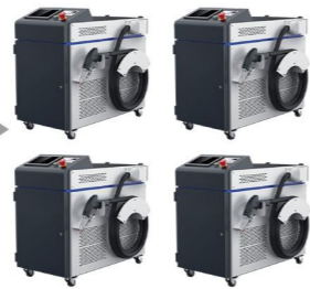
HANDHELD LASER WELDING*4 手持激光焊*4